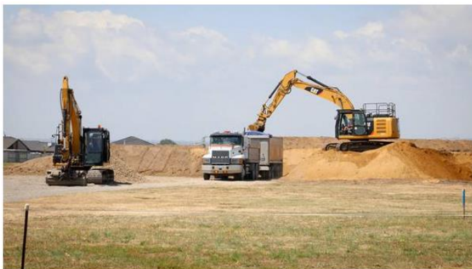
Diggers remove the stockpiled fill in Golden Sands in December.

Removal of the Tsunami Refuge in Palm Springs – now we know why, they want to build a private school here. Are Tsunamis different now?