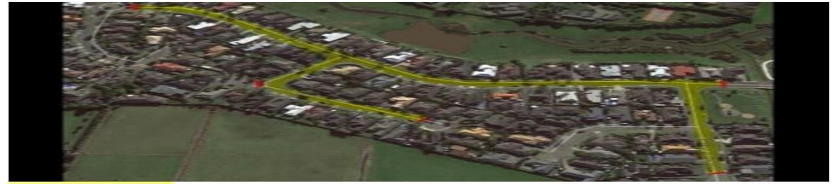
STREETS AFFECTED BY CHIPSEALING APRIL 2019

Excerpt from letter from Chris Phayer to TCC expressing the frustration over the lengthy process to get a resolution