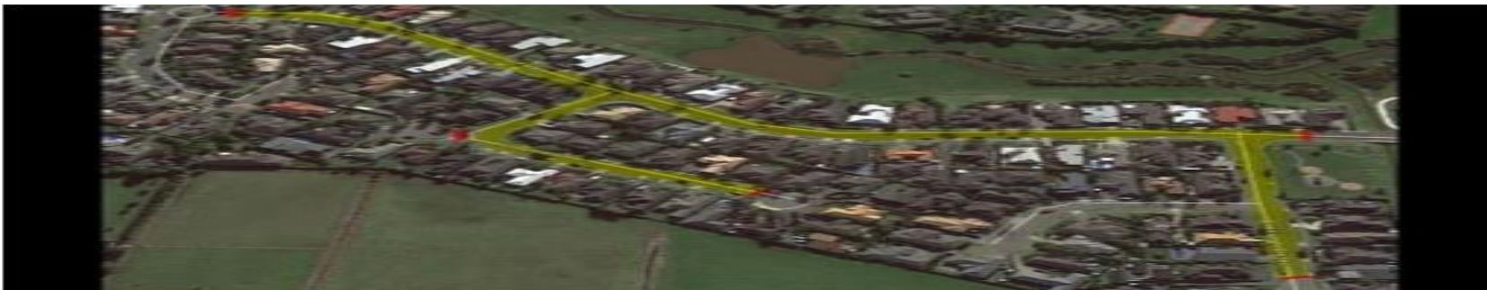
STREETS AFFECTED BY CHIPSEALING APRIL 2019

Today is 9 February 2020 and we have heard nothing more since the email below dated 16 December 2019. Not so much as "update" even.