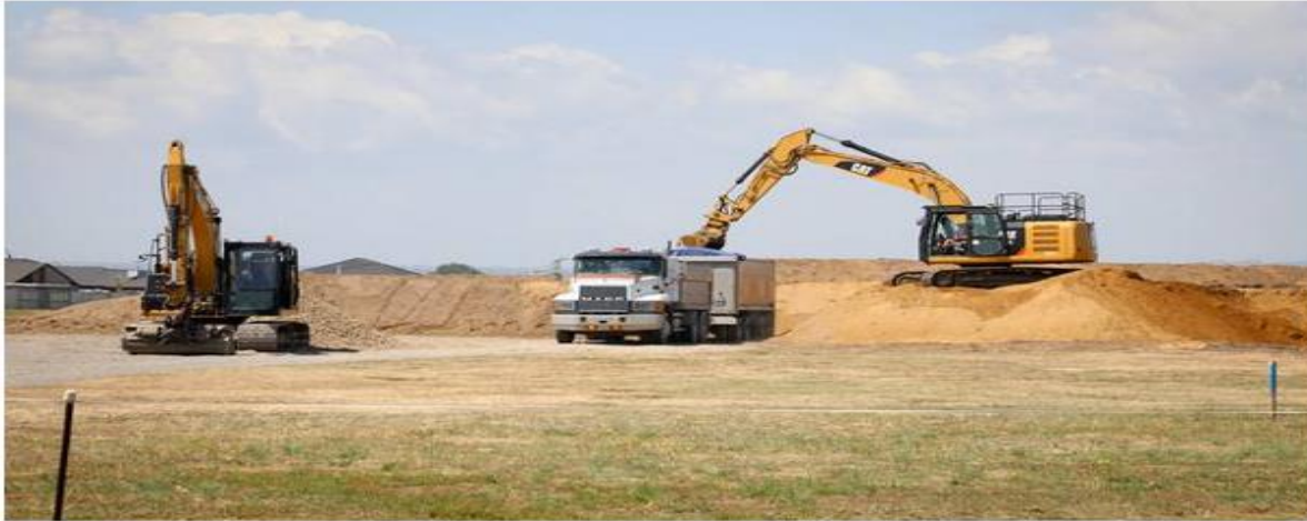
Diggers remove the stockpiled fill in Golden Sands in December.

Plans for a new tsunami refuge in Pāpāmoa East have been abandoned.